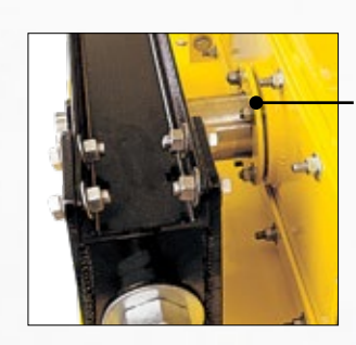
Heavy-duty center pull takeup frame Packing gland shaft seal